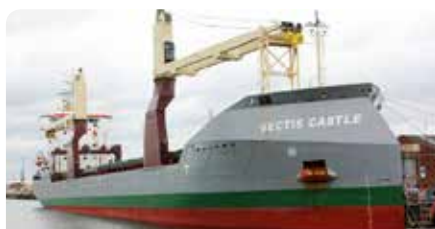
M/V Vectis Castle (or substitute)