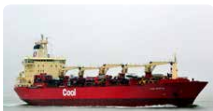
M/V Knud Reefer (or substitute)