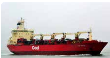
M/V Ivar Reefer (or substitute)